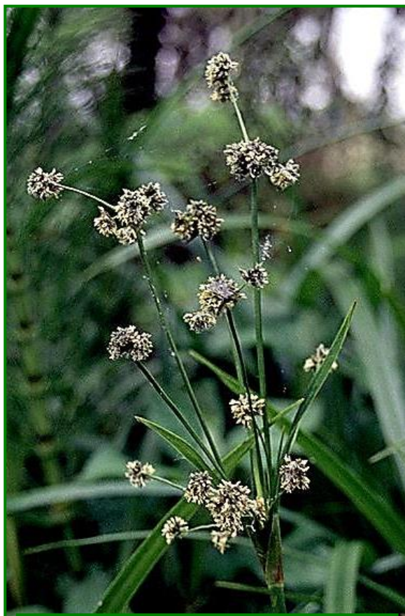
Scirpus microcarpus in flower

Solitary, stout, triangular culms, leafy, 30 to 100 cm tall (1.5 m – Plants for a Future n.d.) from thick, stoloniferous caudex; linear leaves 1.2 to 0.5 cm wide, sheathes tinged red; inflorescence in a large compound umbel, rays spreading or ascending; leaf-like involucre bracts, mostly three, longest often exceeding inflorescence; spikelets ovoid, 3 to 4 mm long; ovate scales marked with green and black, whitish bristles (Moss 1983). Flowers have both