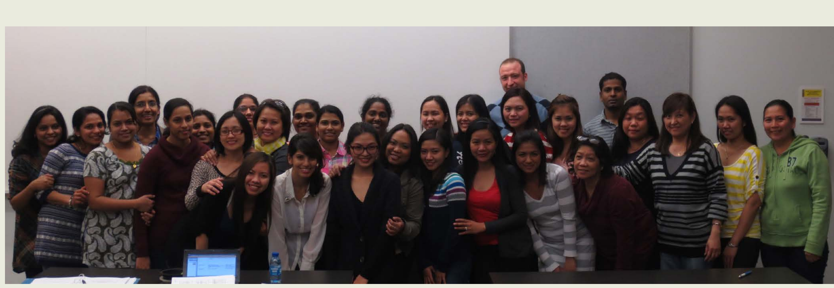
Practical Nursing Bridging Program for IENs (Fast-Track) students at Centennial College in Toronto, Ontario.