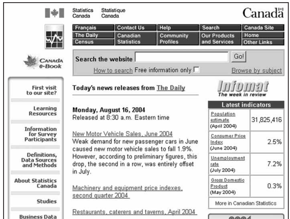
Figure 1: Stats Can Web Site

Like any statistical agency, Stats Can has its own vocabulary, which you will learn as you search. For example, in English, people are “male” or “female” (which makes me think of primates and nature shows), whereas in French, we are more civilized, as we are “hommes” et “femmes” (“men” and “women”).