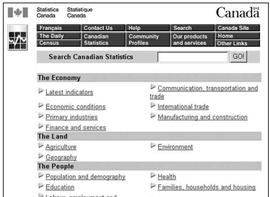
Figure 2: Canadian Statistics Portal