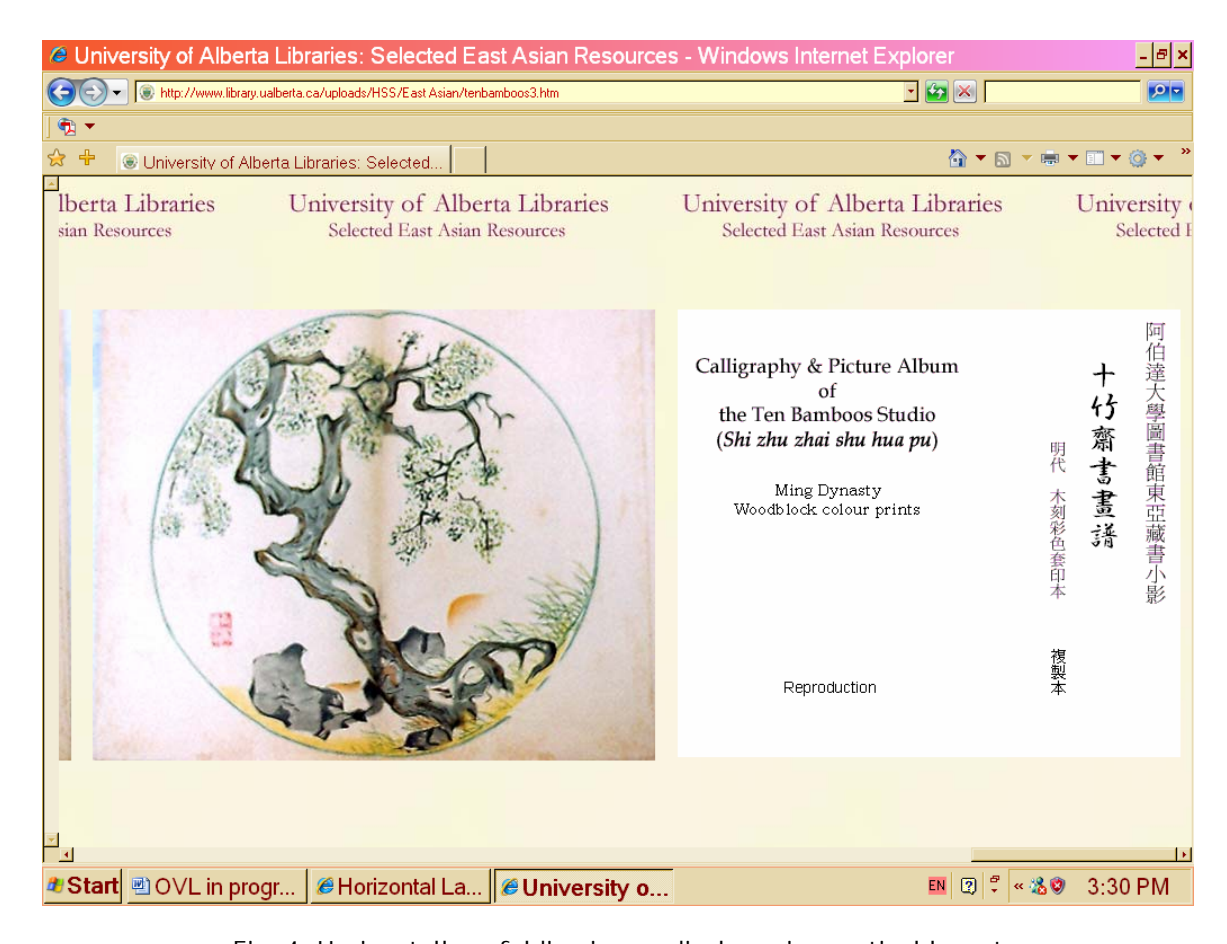
Fig. 4. Horizontally unfolding image display using vertical layout

The essential elements of the source file of this Web display are still the following two, with the ten images contained within the div tags: