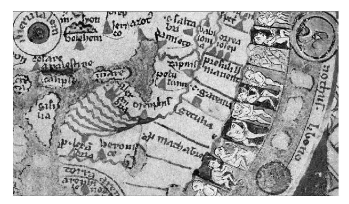
Fig. 2. Detail. Psalter Map. Map Psalter . c.1260. British Library. (C) British Library Board. Add. MS 28681, f.9r. Used by permission.