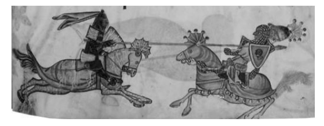
Fig. 3. Saladin and Richard Coeur de Lion. Luttrell Psalter. Fourteenth century. British Library. Add. MS 42130, f.82r. Used by permission.