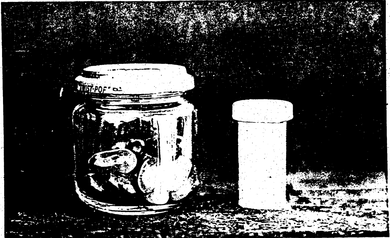
Plate I. Jar of Jelly Beans and Bell. Jar of Jelly Beans and Container of Powder.