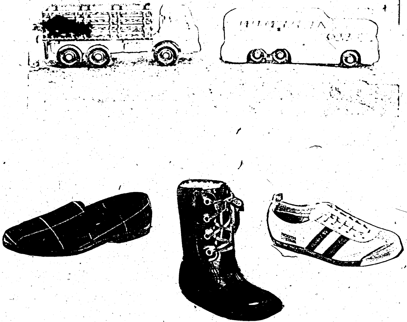
Plate II. Truck and Bus. Slipper, Boot and Runner.