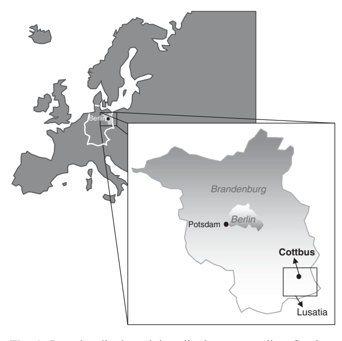
Fig. 1. Lusatian lignite mining district surrounding Cottbus: Geographical position within Europe, Germany and the Federal German State of Brandenburg.

Agricultural recultivation includes agricultural crops such as forages and cereals.