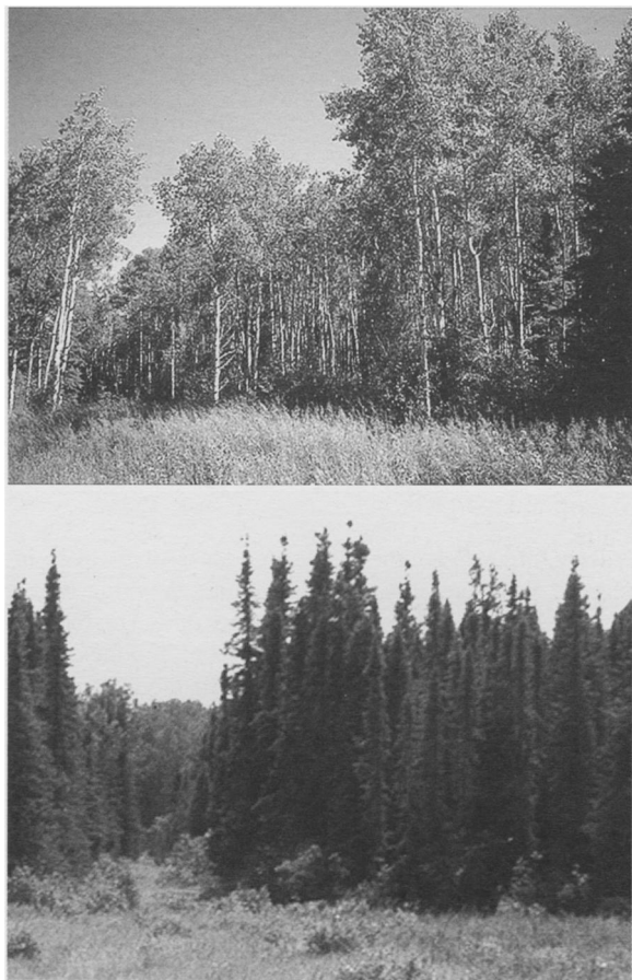
PLATE 1. Aspen (top) and spruce (bottom) are the dominant trees in the mixedwood boreal forest.

usually include a change in species composition. Multiple developmental pathways exist for mixedwood stands in mesic areas (Chen and Popadiouk 2002). The state of a stand is expressed from the interaction of stand condition, context, and disturbance history (Chen and Popadiouk 2002, Albani et al. 2005). Trembling aspen is the typical regenerating species in a stand when it is present in the pre-fire landscape (see Plate 1). This is a result of vegetative shoot development from root suckers. White spruce may establish at stand initiation depending on seed source, micro-site conditions, and interspecific competition (Greene et al. 2004, Albani et al. 2005; see Plate 1). White spruce is shade tolerant and will grow in the understory of aspen stands to be released to the overstory as aspen reaches maturity, dies, and provides gaps in the canopy. Through this pathway, stands may burn, regenerate along a successional trajectory with early deciduous dominance and lower probabilities of initiation, and then develop to spruce dominance and higher probabilities of initiation; a "fire-prone" white spruce can be seen as growing up in a protective aspen nursery. We must consider that initiation patterns (and fire re-