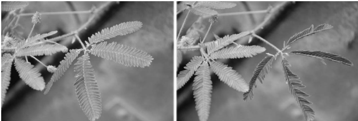
Left, Mimosa pudica leaf at its resting position, with pinnules fully exposed; right, the same leaf a few seconds after being prodded, with its pinnules folded in.