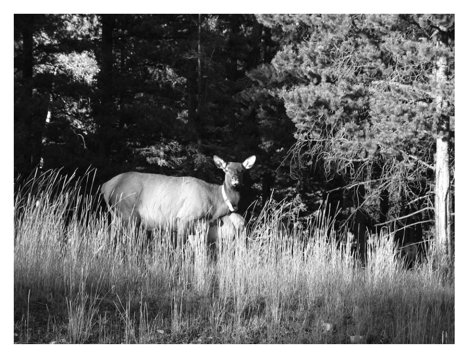
PLATE 1. Migrant and resident elk make trade-offs between risk and forage at different spatial scales. This radio-collared resident elk remained on the winter range during summer, forgoing benefits of migration to high-forage-quality migratory summer ranges but avoided predation by selecting areas close to high human use where wolves avoided humans.

advanced phenology of low-elevation summer ranges. However, avoidance of risky areas undoubtedly exacerbated the overall poorer forage quality of residents, and probably contributed to why resident elk had lower pregnancy rates than migrants (resident = 0.83, n = 63, migrant = 0.90, n = 78, P = 0.02) and reduced calf body mass (resident = 97.3 kg, n = 11, migrant = 117.9 kg, P < 0.001; see Hebblewhite [2006] for details). Environmental stochasticity in forage quality may therefore leave residents especially vulnerable. The next step is to directly link resource selection and resulting forage and predation exposure by residents and migrants to demographic differences, the true measure of the consequences of resource selection.