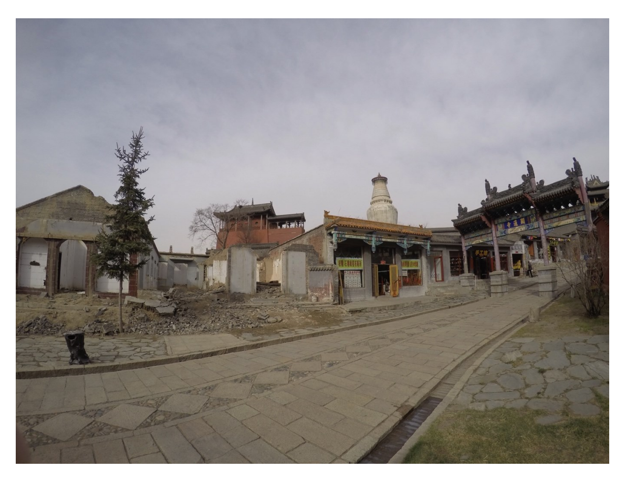
Figure 13: The removal project in the core zone of Taihuai is still in the process

Although the area near Tayuan Monastery, Wanfo Ge and Shuxiang Monastery is now a park with planted trees and lawn and stone pathways, the removal project seems to be at a standstill after almost ten years (Figure 13). In contrast, the construction of visitor center and a shopping plaza has completed. The plan aims to separate Taihuai into different functional areas such as a shopping area, an area for entertainment and an area for visiting monasteries. Besides the construction in Taihuai, "building a communications infrastructure" is also important since it "permits millions of tourists to come by air and road" (Sutton and Kang 2010: 103). In this case, the government has built a highway that connects Mount Wutai with major cities such as Taiyuan and Beijing. In addition, Mount Wutai's airport came into use in December 2015. The entire master plan of Mount Wutai is expected to be complete in 2020.