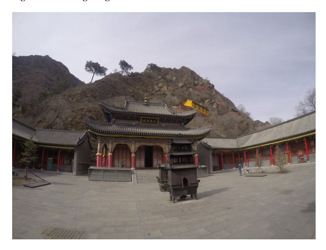
Figure 21: Guanyin Cave