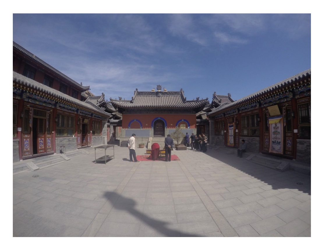
Figure 20: Shifang Tang