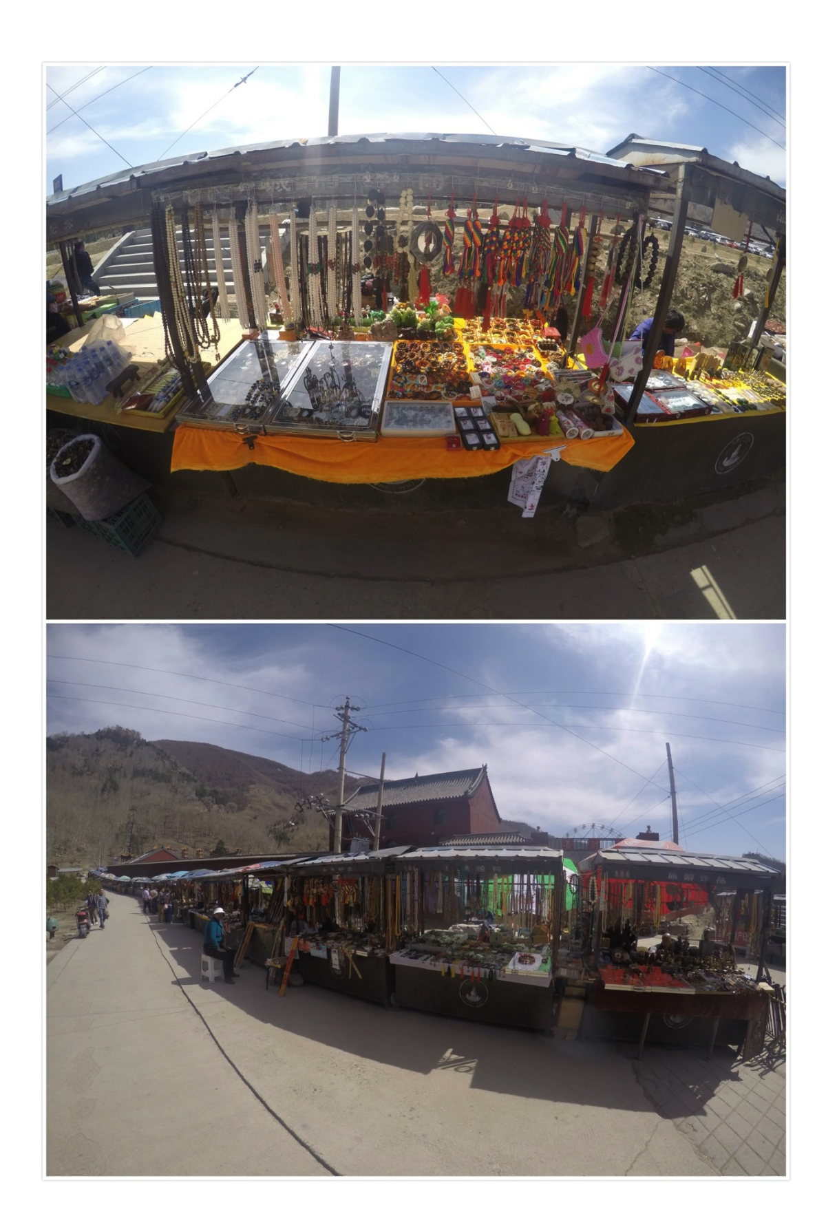
Figure 16: Stalls on the way up to Dailuo Ding