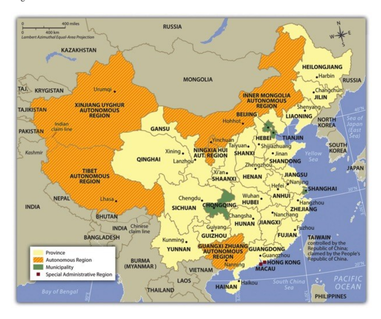
Figure 3: A map of P.R. China (https://saylordotorg.github.io/text_world-regional-geography-people-places-and-globalizat ion/section_13/a84bc086764dac58a8c9c4467677ce79.jpg)

Buddhist center in China, while the Tibet Autonomous Region (西藏自治區 in Figure 3) is the largest.