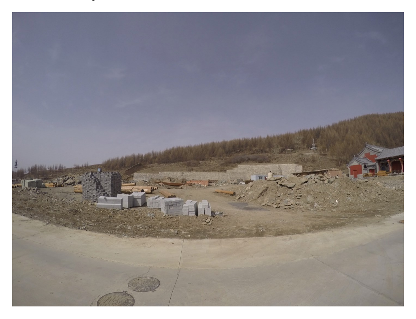
Figure 9: Yuhua Monastery is under reconstruction

Monastery (玉華寺 in Figure 9)." In other words, these 82 monasteries are officially registered and under the management of the local bureau.