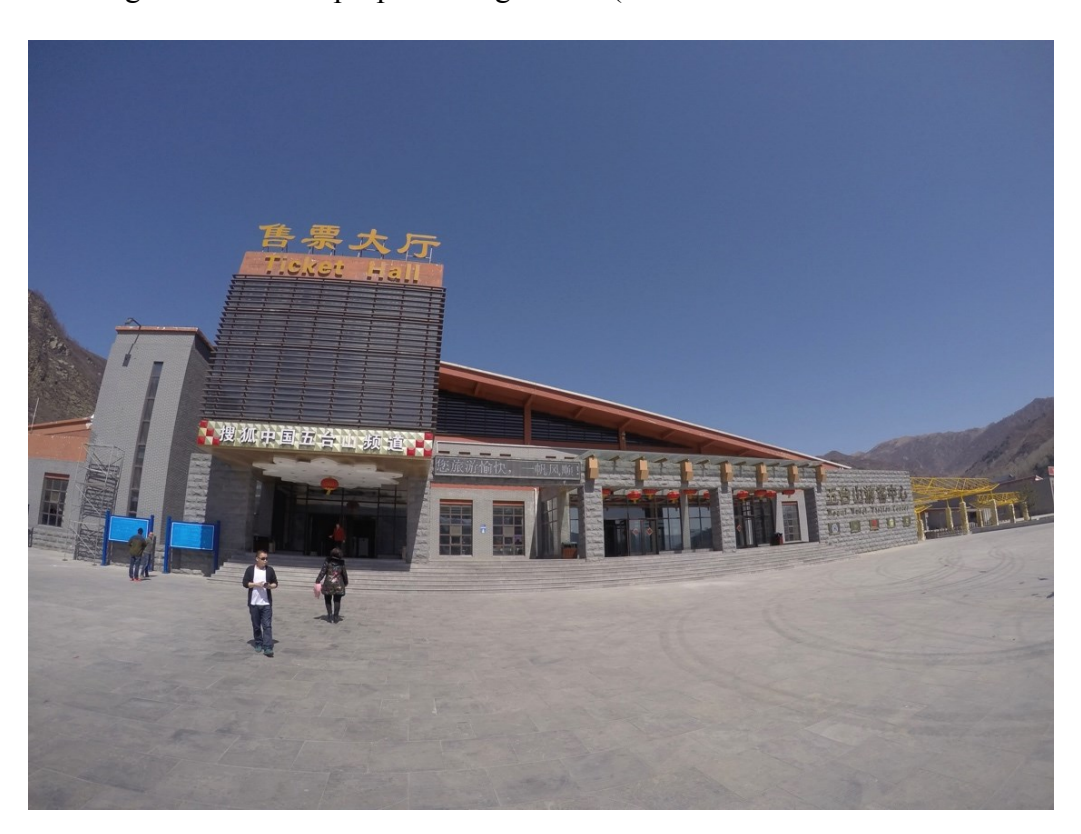
Figure 14: The visitor center at southern gate

The current main entrance of the park is located on the south side, where visitors pay an admission fee at the visitor center (Figure 14). The most recent regulation came into force since 1st of July 2015 that replaced the previous admission standard. According to the current standard, the admission fee is flexible depending upon seasons, ranging from 145 Yuan (around 29 Canadian dollars) to 120 (around 24 Canadian dollars) Yuan. Nonetheless, visitors needed to pay a mandatory transportation fee (50 Yuan, which is around 10 Canadian dollars) at the visitor center before the current regulation was carried out. According to the previous regulation, during the peak season (1st of April to 31st of October), vehicles without the local license plates had to be parked at the public parking lot, as only government-approved public transportation or government-owned vehicles were allowed to enter Mount Wutai. "During non-peak season (1st of November to 31st of March) the group and private-car visitors can choose to take their own traveling method under proper management" (UNESCO Nomination File 2009: 277).