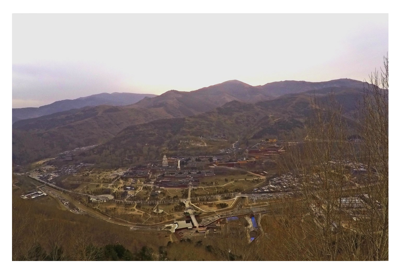
Figure 2: Taihuai seen from Dailuo Ding

Mount Wutai is also a popular summer resort, and was formerly called Mount Clear-and-Cool. A number of Buddhist monasteries are situated along the valley in Taihuai Town. Taihuai Town is the most concentrated area of Buddhist monasteries, and is the center of the Mount Wutai National Park, and the center of Buddhist activities in the area (Hou 2003: 60).