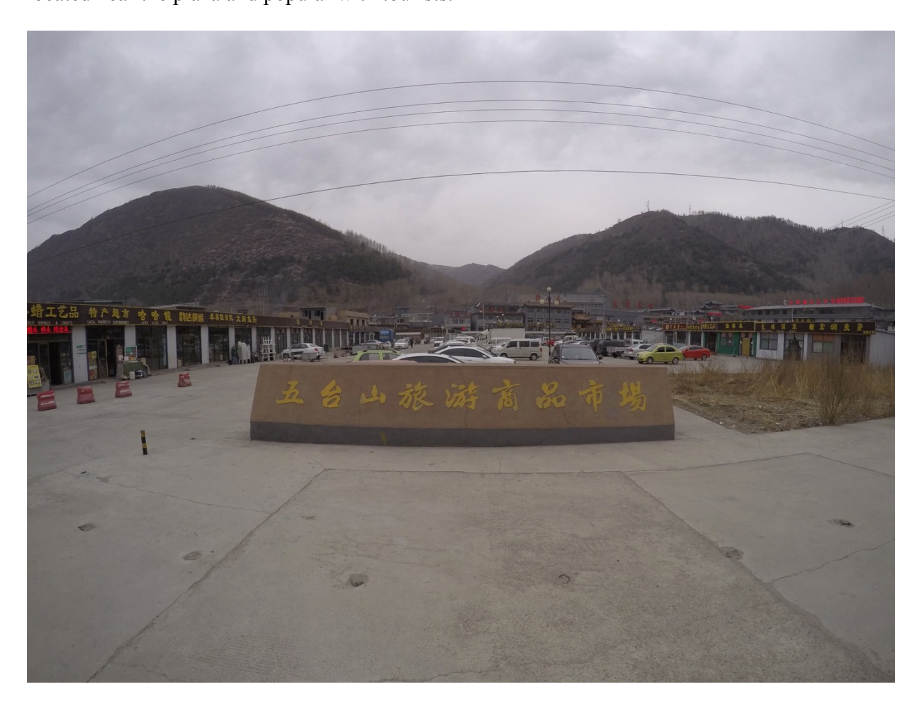
Figure 15: New shopping plaza

The new designed shopping plaza (Figure 15) is located in Yangbaiyu Village (杨栢峪村), 2.5 kilometers away from Wanfo Ge. I walked about thirty minutes along the main street from Wanfo Ge to the plaza. Shops and restaurants occupied the plaza, and the open space at the center had been turned into a huge parking lot. A night the souvenir shops were closed and the plaza was transformed into a night market for street food, where many tourists enjoyed Chinese barbecue and beer. Places for entertainment such as sauna centers and karaoke bars are also located near the plaza and popular with tourists.