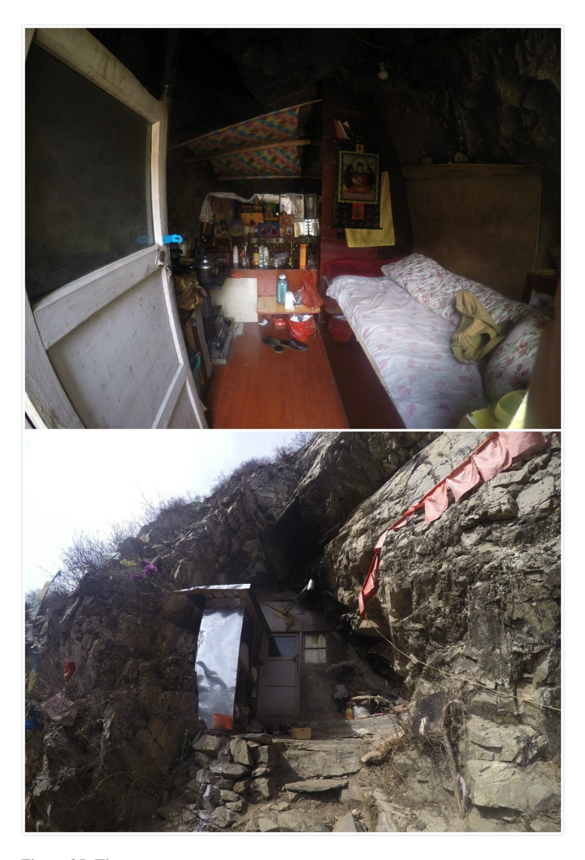
Figure 25: The retreat caves