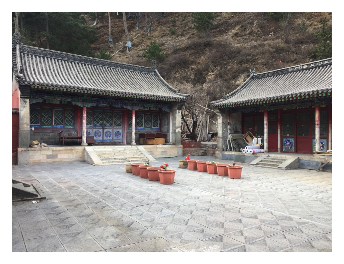
Figure 5: The Changkya Khutukhtu's residence at Zhenhai Monastery

In later years, the Manchu court gave back to Chinese Buddhist monks the control of Chinese Buddhist monasteries, such as Xiantong Monastery, but the Jasagh Lama in practice was the highest ranked administrator of Mount Wutai. As Chou observed, "The development of Tibetan Buddhism at Wutaishan in the Qing dynasty has offered a different vantage point from which to view the making and remaking of a Chinese Buddhist landscape" (Chou 2007: 124).