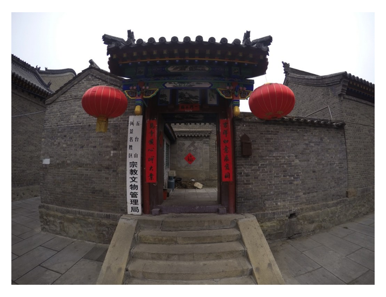
Figure 8: The Bureau of Religion and Cultural Heritage of the Mount Wutai National Park in Xiantong Monastery

During the Cultural Revolution, a number of monasteries collapsed because of severe damage, and some were demolished and looted on purpose. For example, under Lin Biao's (林彪) order, Taipingxingguo Monastery (太平興國寺), Bore Monastery (般若寺) and Jingang Ku (金剛窟) were bombed for "military use" in 1970 (Hou 2003: 132). The real purpose, however, was to build a personal villa for Lin Biao rather than for the military. In addition, the Red Guards destroyed a large number of village temples. In 1977, the Cultural Revolution resulted in the number of Buddhist monasteries decreasing to 63 in Wutai County and around 10 monasteries relatively remained in the original appearance in the inner terrace (Hou 2003: 132).