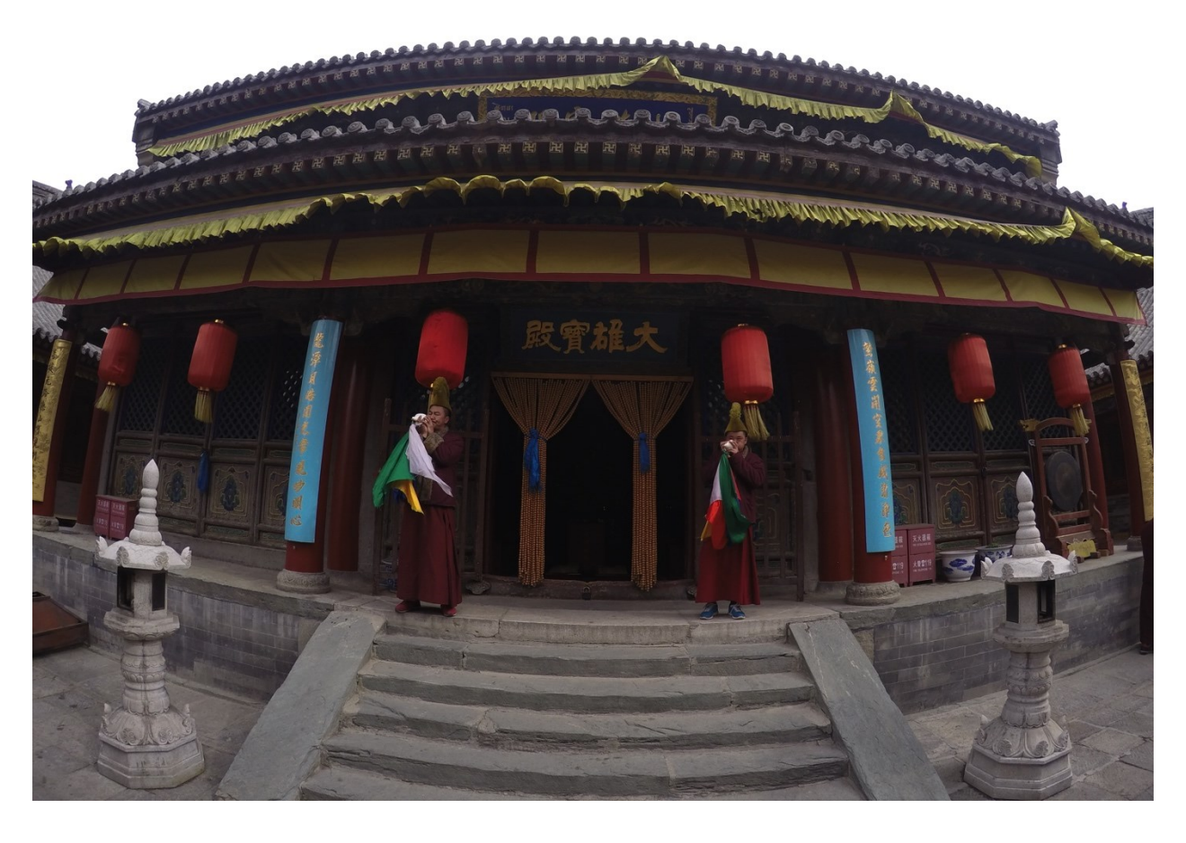
Figure 6: The Main Hall of Luohou Monastery

Buddhist sutras that are chanted at different monasteries during zaoke normally include Shurangama Mantra (《楞嚴咒》), Nilakantha Dharani (《大悲咒》), ten mantras (十小咒), and Prajnaparamitahrdaya (《般若波羅蜜心經》 the Heart Sutra), but the schedule is different among monasteries. For example, zaoke at Luohou Monastery starts at five in the morning, and it ends around six thirty. Dailuo Ding's zaoke starts at four thirty. In contrast, Zhenhai Monastery's lamas started their zaoke around eight thirty in the morning on the day that I visited. Zaoke and wanke at Chinese Buddhist monasteries are led by karmadana (維那). Tibetan Buddhist monasteries' zaoke and wanke such as Luohou Monastery are led by dbu mdzad (翁則).