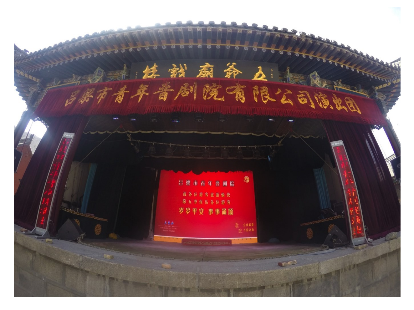
Figure 23: The opera stage at Wanfo Ge

include the payment for the opera troupe.