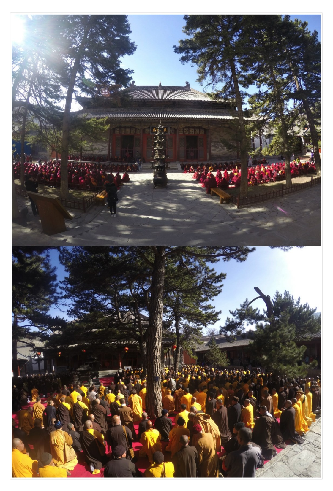
Figure 7: Tibetan Buddhist practitioners (up) and Chinese Buddhist practitioners (down) at qiansengzhai in Xiantong Monastery