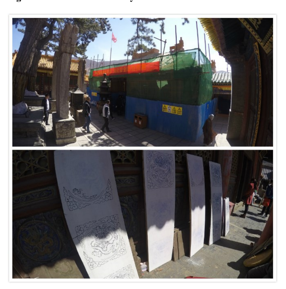
Figure 19: Repairing work at Pusa Ding