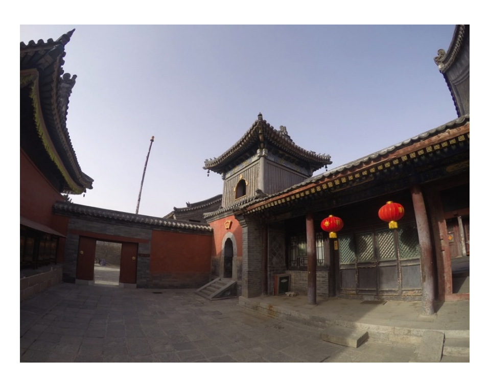
Figure 18: Luohou Monastery