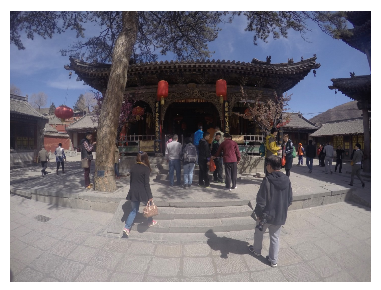
Figure 22: The Wuye Hall at Wanfo Ge

xuyuan (許願) and huanyuan (還願). Xuyuan is to make a vow that the person will come back to the temple to thank Wuye once the wish had been achieved. Huanyuan is to redeem the vow that come back to thank for Wuye usually by providing offerings. The locals believe that Wuye enjoys traditional opera. Accordingly, the local people built an opera stage opposite the hall in the front yard of the Wanfo Ge (Figure 23). Wuye's believers usually promise that they will pay an opera troupe to perform for Wuye once the wish comes true.