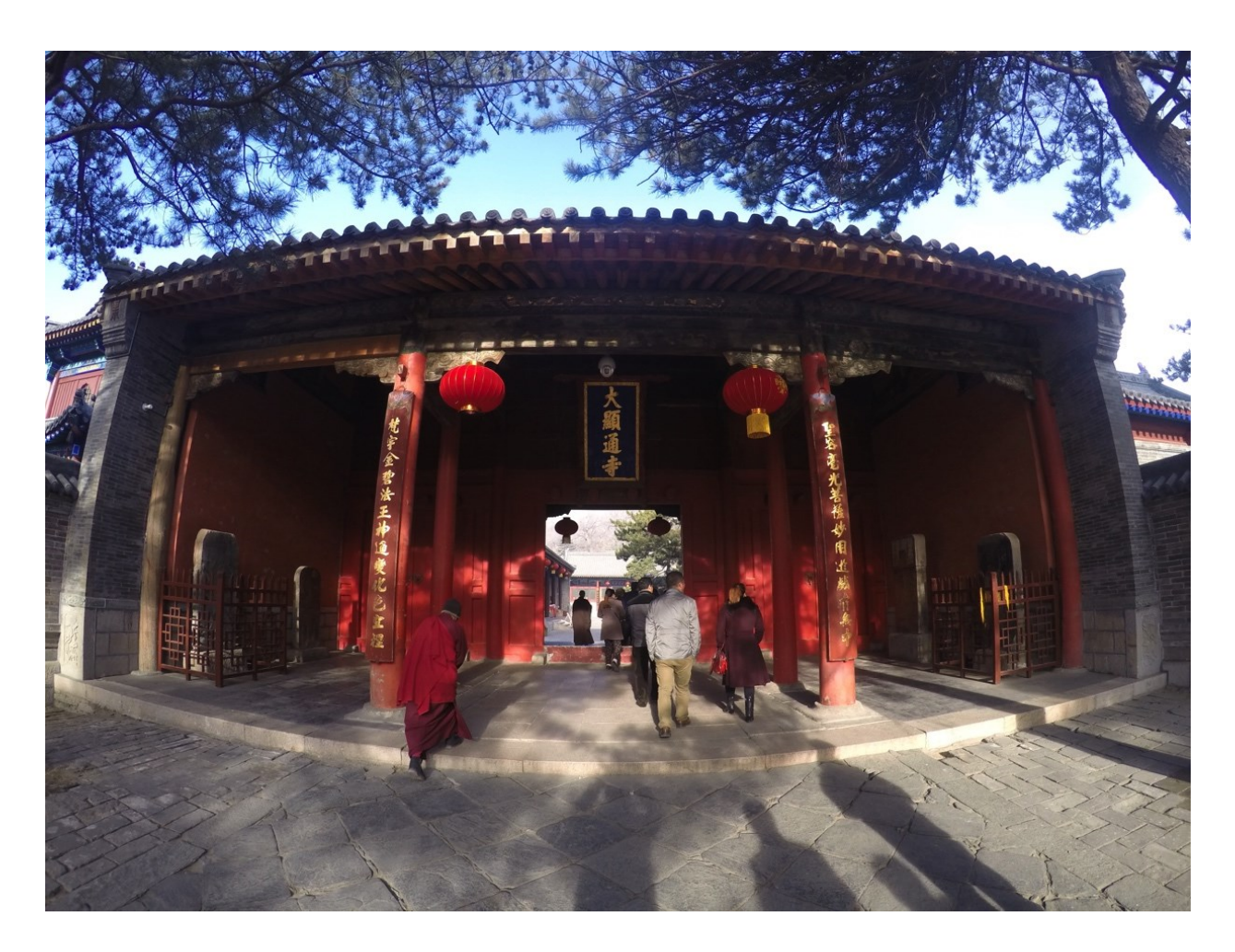
Figure 4: Xiantong Monastery

Cui proposes, however, that the emergence of Buddhism at Mount Wutai area can be traced to the Eastern Jin dynasty (317-420 AD) when Master Daoan (道安法師) introduced Buddhism to the region (Cui 2000: 88). According to Robert Shepherd, Mount Wutai "was transformed into a Buddhist site in the Fifth Century AD when the rulers of the Northern Wei dynasty ordered the construction of temples dedicated to the Bodhisattva Manjusri over the next fifteen centuries" (Shepherd 2013: 11). In addition, Robert Gimello argues, "there were Buddhist monasteries at Wu-t'ai as early as the Northern Wei dynasty" (Gimello 1992: 99).