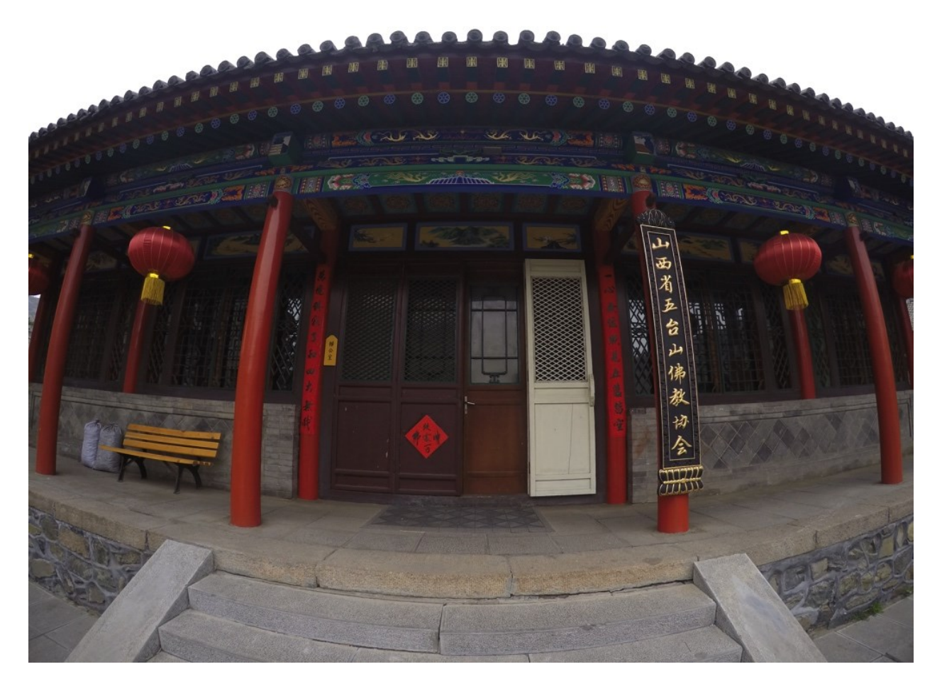
Figure 10: The Buddhist Association of Mount Wutai

One of current routines of the Buddhist association is to organize the fortnightly meetings that call together representatives of each monastery to study the CCP's principles and policies as well as government documents (Hou 2003: 148). Fortunately, a local official allowed me to attend one of the meetings. The Buddhist association organized the meeting, but officials from the Bureau of Religion and Cultural Heritage led it. Four government officials gave speeches one by one according to their political positions from high to low. One of them read a few recent government documents. None of the attending Buddhist practitioners were taking notes except a very few officials and myself. In fact, some Buddhist practitioners were chatting or looking at the cell phone sometimes. Interestingly, an elderly monk was meditating once he sat down