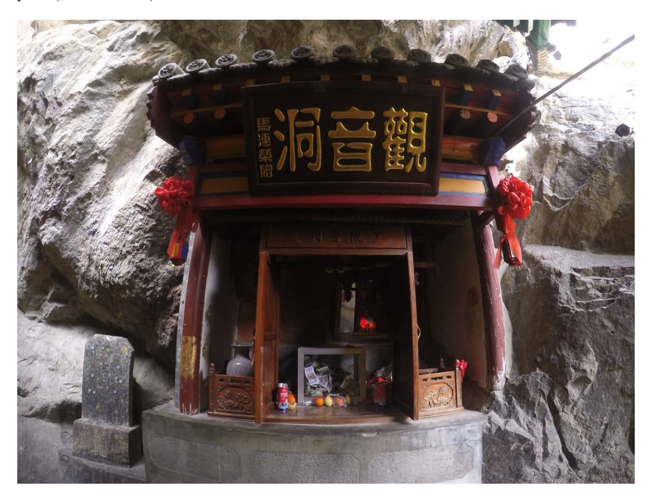
Figure 26: The cave where H.H. the 6<sup>th</sup> Dalai Lama meditated

Besides Jasagh lamas and the Changkya Khutukhtu who were given control over Buddhist affairs by the Manchu emperors and lived at Mount Wutai, His Holiness the Dalai Lama was also associated with Mount Wutai. For example, H.H. the 6<sup>th</sup> Dalai Lama was the first Dalai Lama who made the pilgrimage to Mount Wutai during the Qing dynasty (1636-1912 AD), and H.H. the 6<sup>th</sup> Dalai Lama meditated in a small cave (Figure 26) at Qixian Monastery (棲賢寺) for six years (Cui: 2000 755).<sup>21</sup>