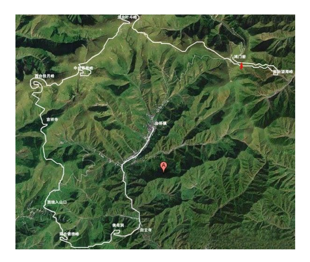
Figure 17: A map of routine of chaotai

(http://www.seelvyou.com/html/2013/wutaishan_0424/951.html)