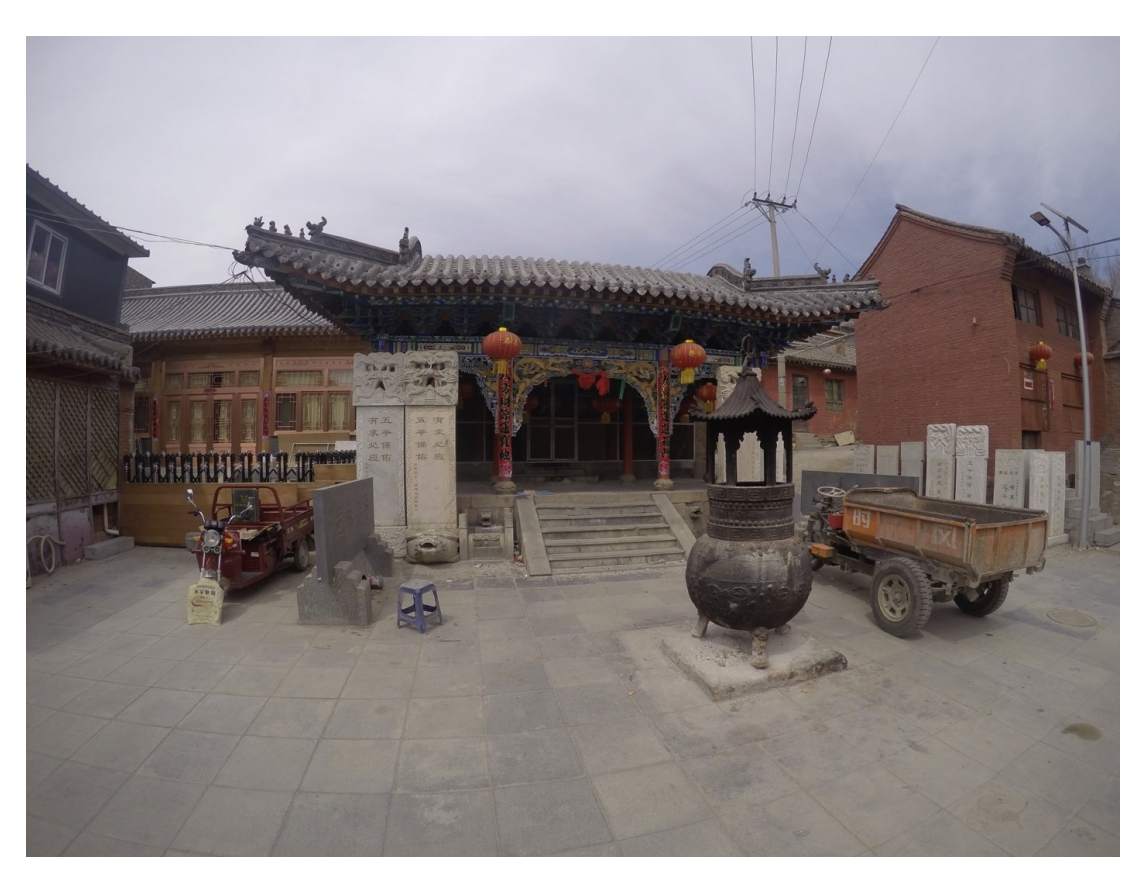
Figure 11: Wuyeguli

The speeches and government documents were focused on creating a better environment for tourism. Following issues were emphasized: first, as a popular tourist site, hygienic, environmental, and safety issues must be solved. Second, all pit latrines without a flushing attachment in monasteries must be renovated to flushing toilets. Third, it declared a ban on village temples (村廟). For example, the local government has shut down Wuyeguli (五爺故里) as shown in Figure 11.18 Village temples are very popular and can easily be found in many villages. These village temples are associated with popular religions rather than Buddhism. A large number of visitors, however, do not know this fact. Some local residents had taken advantage of this situation to encourage visitors to donate money.