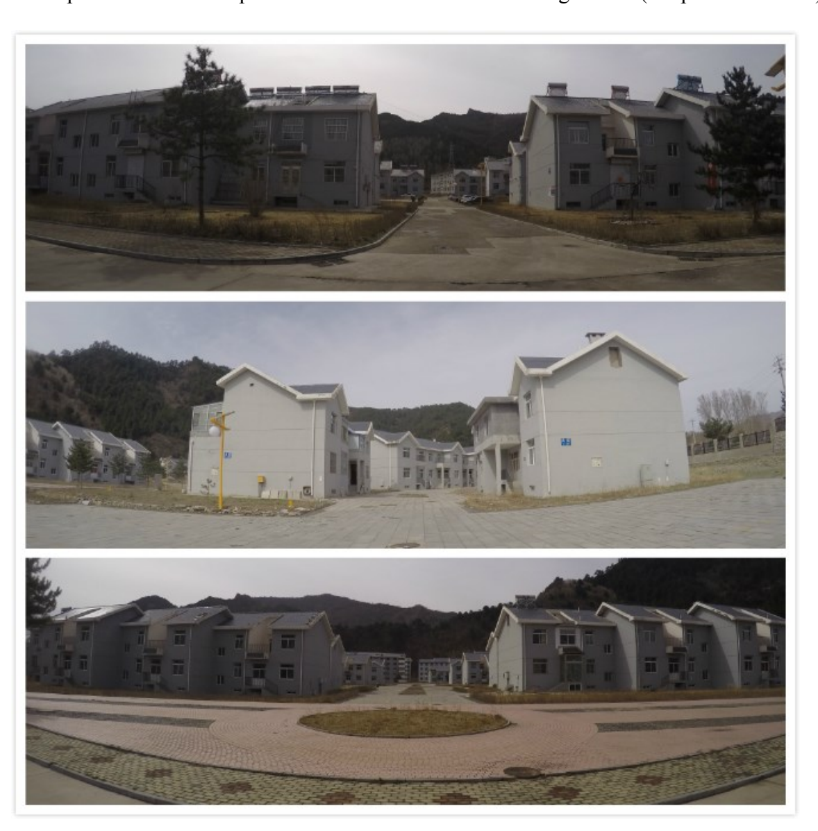
Figure 12: New dwellings for relocated families from Taihuai in Jingangku Township

the settlements of Dongzhuang and Guizicun and 36 hotels and 108 shops (UNESCO World Heritage Center-Mount Wutai) (Figure 12). According to Shepherd, "[d]uring the first stage of displacement, houses and shops below Ta Yuan, Wofo [Wanfo Ge], and Guangren [also known as Shifang Tang] temples were demolished and farmland north of town confiscated to build parkland" (Shepherd 2013: 102). In following years, the government planned to replace local residents' homes, shops, and farm land with "green space and park lands, designed to accentuate the importance of the temples and monasteries listed as heritage sites" (Shepherd 2013: 12).