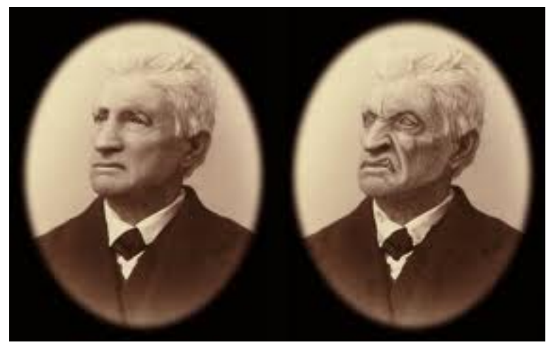
Negative Animus (www.thelisticles .net)