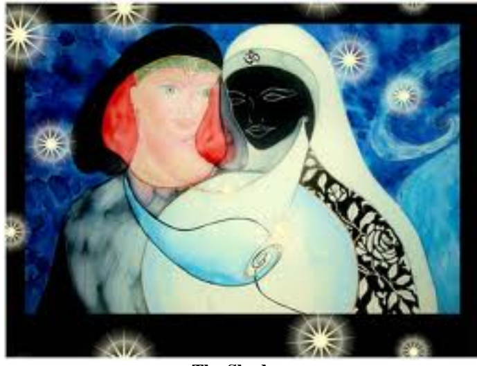
The Shadow (embracetheshadow.com)