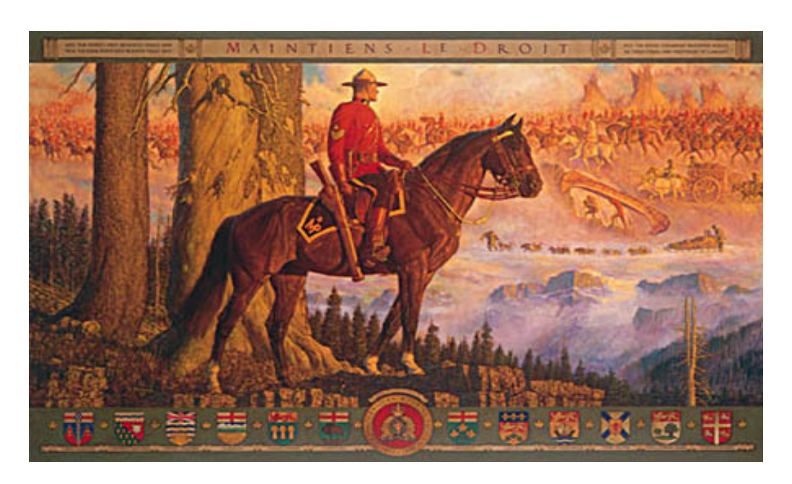
The Heroic Image of a Mountie (Arnold Friberg, 1963)

I became known as the "cop." My children were the "cop's" kids. The archetype of the hero even blanketed the individuality of my family members. This permitted me to connect to a larger than life heroic image.