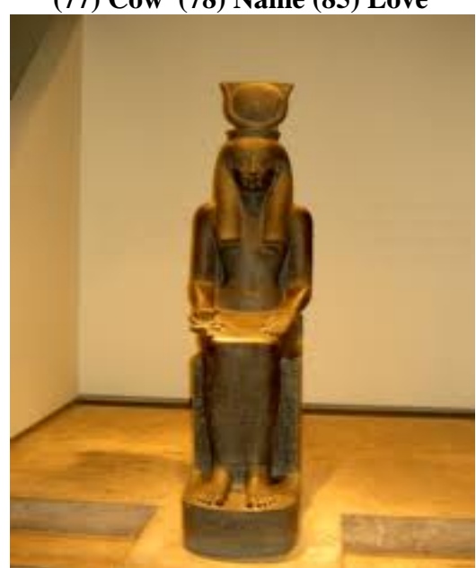
The Goddess Hathor (Luxor Museum, Egypt)