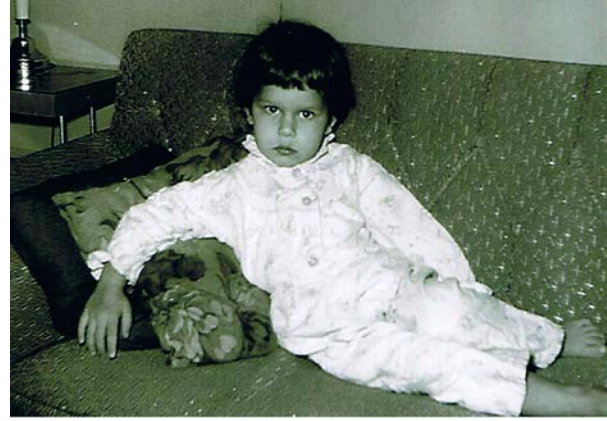
Myself, the Orphan child