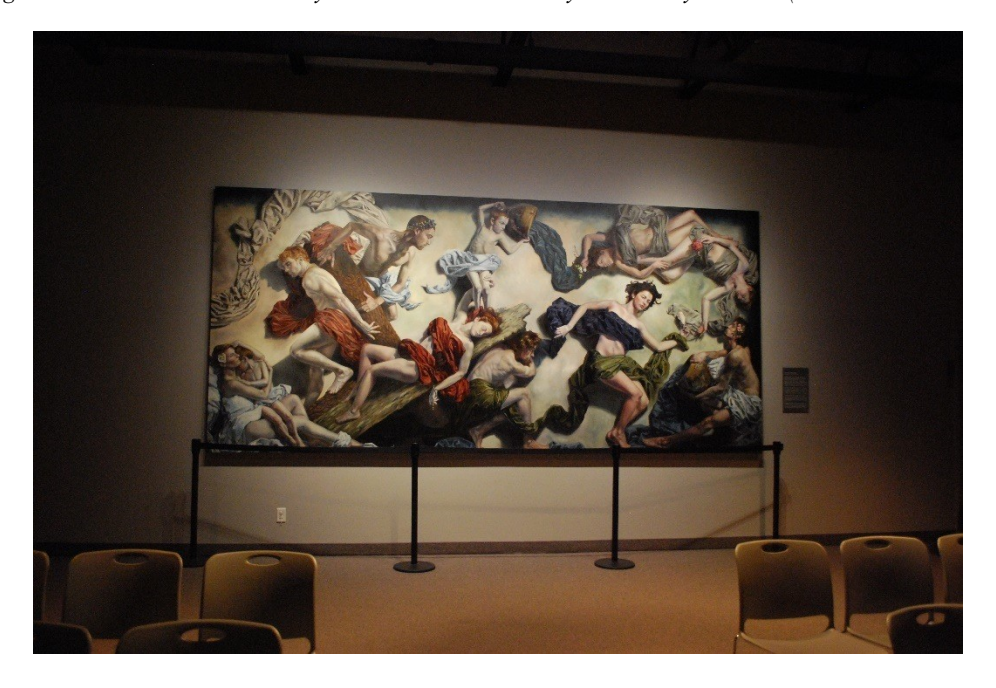
Figure 2: "Fraternal Codependence" by Nicholas Napoletano