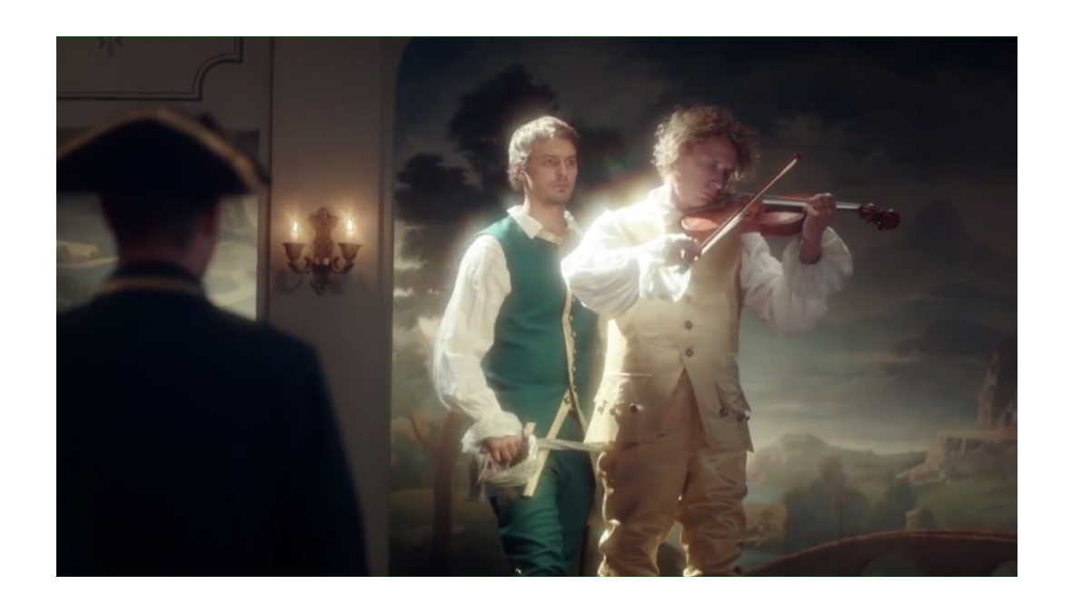
Figure 3.5 Peter III plays the violin knowing he is about to be assassinated