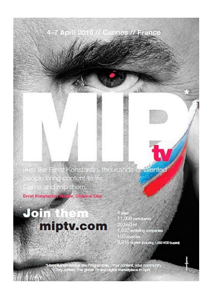
Figure 7.1 The Cover of the 2016 MIPTV event program

give the keynote address at the conference, a clear sign that he is held in higher regard than any other Russian television executive. In 2015 he was given the Médaille d'Honneur award along with three other prominent media executives at MIPTV. <sup>12</sup> Finally, his face appeared on the official program for MIPTV at the 2016 version of the event with the caption "Just like Konstantin Ernst, thousands of talented people bring content to life; come mip them [sic]" (Figure 7.1). It is clear that Ernst is a major figure in the global media market, certainly to the extent that his presence is an attraction for other media executives. This appeal is not surprising since he does have a very prominent position at the largest station in what was one of the fastest-growing television markets in the world until the 2014 collapse of the ruble and dramatic fall in oil and gas prices.