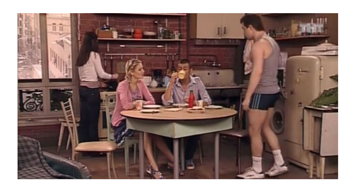
Figure 6.1 The common space shared by the characters in TNT's University

The characters fit into a few broad stereotypes: Sasha the spoiled rich kid, Tanya the morally conservative prude, Kuzia the athletically obsessed jock, Alla the sexually permissive girl and Gosha the sexually obsessed male. Much of the humor comes from the clash of these very distinct character tropes. For the most part, each one remains firmly within the bounds of their expected roles, all of which are quite exaggerated. Kuzia, for example, is not just an athlete, he embodies the notion of the "dumb jock." He is completely obsessed with sports, trains constantly and can barely string together two sentences because of his below average intelligence. As a result, he often does not understand what others are saying or misconstrues statements that have potential double meanings.