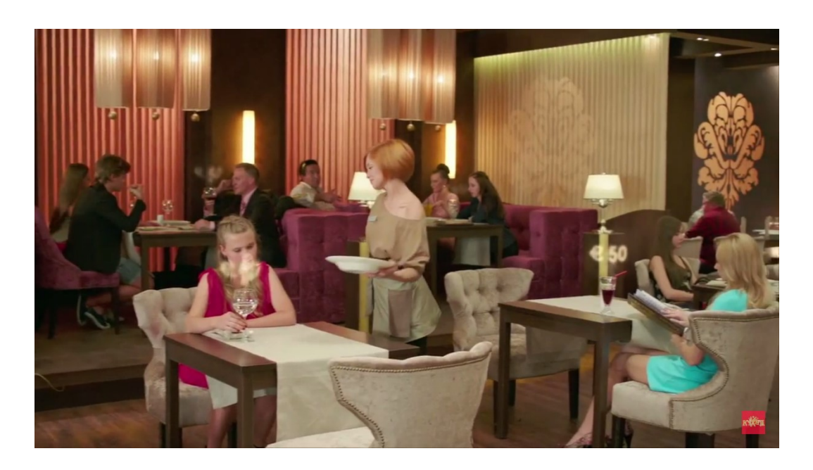
Figure 5.1 The dining room at the Claude Monet Restaurant

equipment dominate (Figure 5.2). The images below illustrate the odorlessness of the mise-enscene in the series. The only significant cultural marker that appears in the restaurant are the head Chef's fan paraphernalia for his favorite sports club, FC Spartak Moscow. As part of the localization of the program, these items could easily be changed to match the new context.