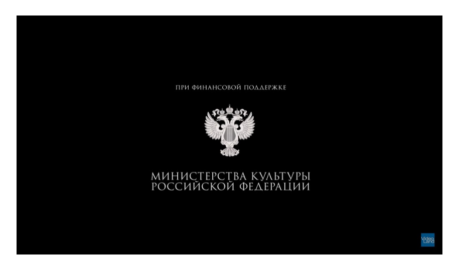
Figure 3.3 The Ministry of Culture of the Russian Federation's logo which appears at the beginning of each episode.

Russian example that represents the confluence of state power and memory is the 2014 twelve-part miniseries Yekaterina ( Catherine ). The visual text was produced by Rossiya One and made with money provided by the state. As such, it further exemplifies ways of creating unified historical memories of the Russian past.