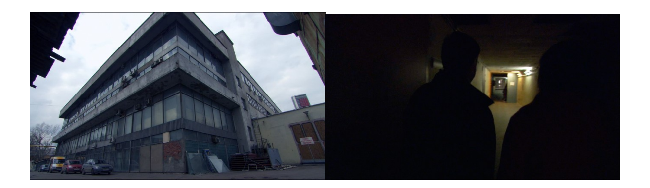
Figure 4.1 Gorky Film Studio exterior and interior shots from the film Exporting Raymond

were people dressed in modern costumes... There were a variety of shows going on, so it was like a crazy campus... it was a little like Hollywood in the 20s."<sup>13</sup> Because of these problems, many Russian producers were dependent on Sony's help to bring their productions in line with international standards.