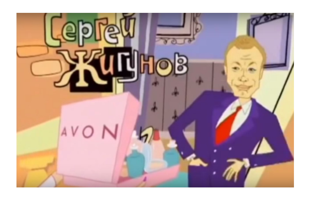
Figure 4.2 The opening credits of My Fair Nanny. Vika's cosmetics case bears the Avon cosmetics brand's logo.

Sony's commitment to embedding itself in the Russian market is evident in their willingness to invest capital long term in the market. In 2006 the company, which had primarily been cooperating with the Russian production company Amedia decided to purchase a controlling share in another studio LEAN-M.<sup>28</sup> By purchasing this company, Sony was able to acquire approximately five percent of the television serial production in the Russian market. Tucker, suggested that this type of investment is key in the Russian market because of the perception of foreign media companies as being imperialistic. He suggested that "if they think that you're just there to make money and to bugger off, then I don't think they're going to be interested in you."<sup>29</sup> For Sony to operate for extended periods of time in the Russian market and have the sort of success that they had, one of the keys was that they had to keep some of the capital that they generated in the country.