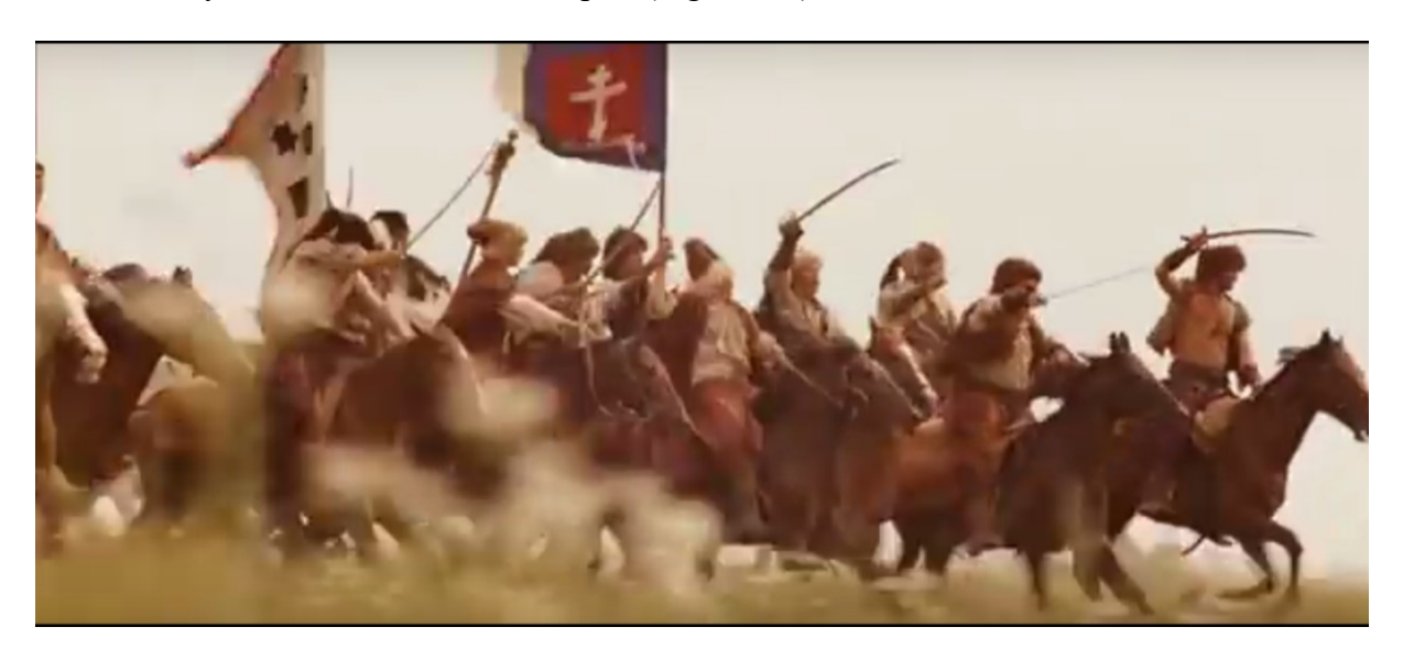
Figure 3.1. Cossack riders carrying Orthodox banners ride out to meet an unseen enemy

denotes early forms of the Russian Empire (Figure 3.1).