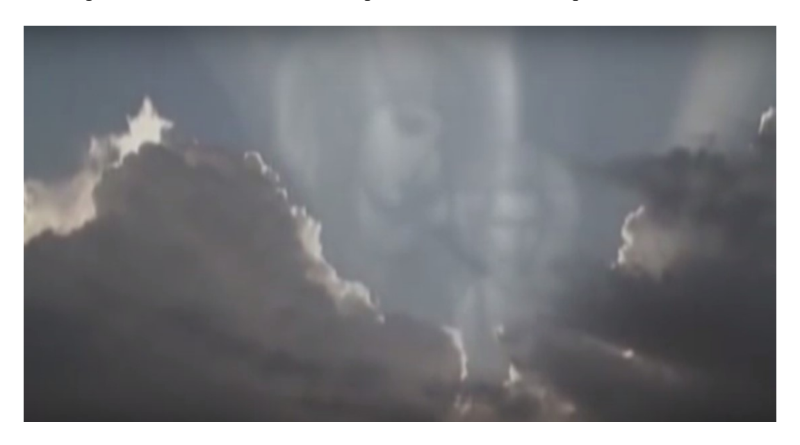
Figure 3.2 The Icon of Our Lady of Kazan appears in the sky above the battlefield in Penal Battalion.

of that period, but rather in a renewed pride in Russian accomplishments.