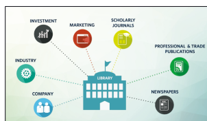
The multiple types and sources of secondary market research may seem intimidating.

We were interested in how we could support this expanding and broad-based research need in a sustainable and flexible way.