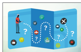
We hope to offer approachable steps to conduct industry research.