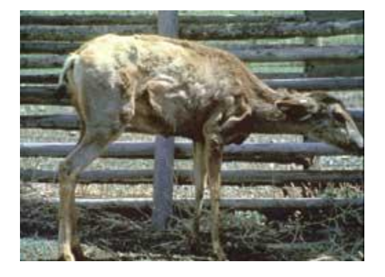
Figure 1. Mule deer doe with CWD in Wyoming.